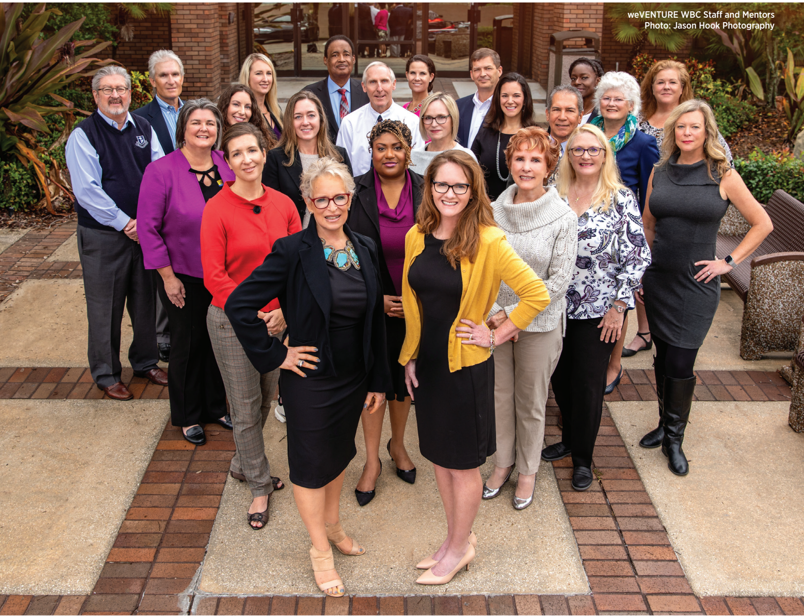
weVENTURE WBC Staff and Mentors